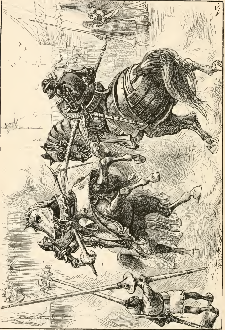
The Tournament for the Sparrowhawk.